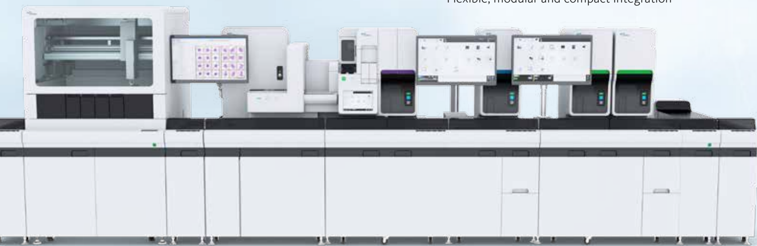
XN-3100 Compact Automation