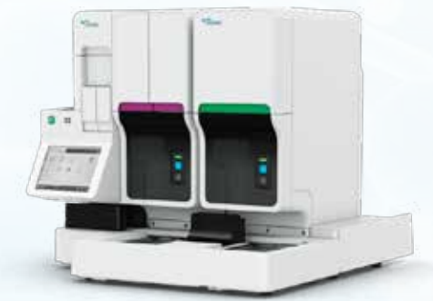
XN-1500 Simplifying Automation

Hourly throughput: 100 CBC samples with 30-75 slides an hour