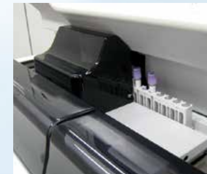
Enhanced workflow with an integrated smear preparation and cell-pre-classification unit based on user-defined rules and conditions