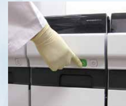
Single master switch for easy startup of the XN-9100

The XN-9100 Series comes in five alternative layouts to accommodate existing building fixtures such as pillars or water supply points without the laboratory undergoing any major renovations.