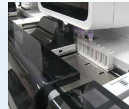
Automatic sample analysis, including reflex testing, according to LIS test orders